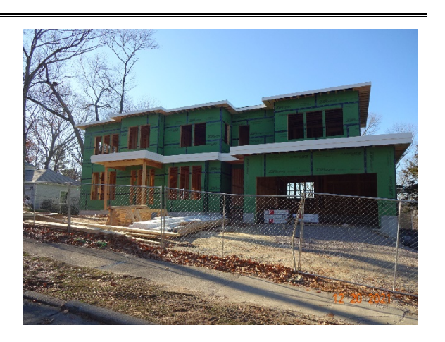
265 Upland Avenue

The purpose of this memorandum is to provide the City Council and the public with technical information and planning analysis conducted by the Planning Department. The Planning Department's intention is to provide a balanced review of the proposed project based on information it has at the time of the public hearing. Additional information about the project may be presented at or after the public hearing for consideration at a subsequent working session by the Land Use Committee of the City Council.