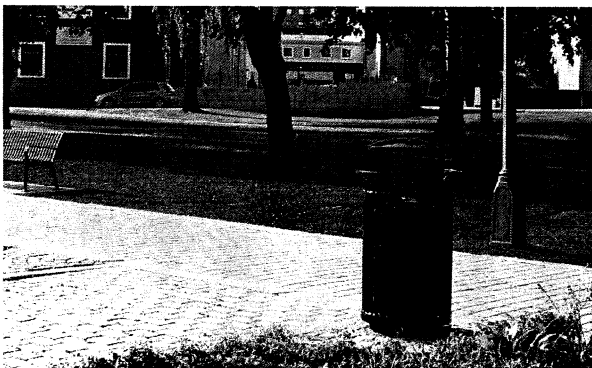
An image of the receptacle with rain bonnet that was piloted (photo not taken in Newton).