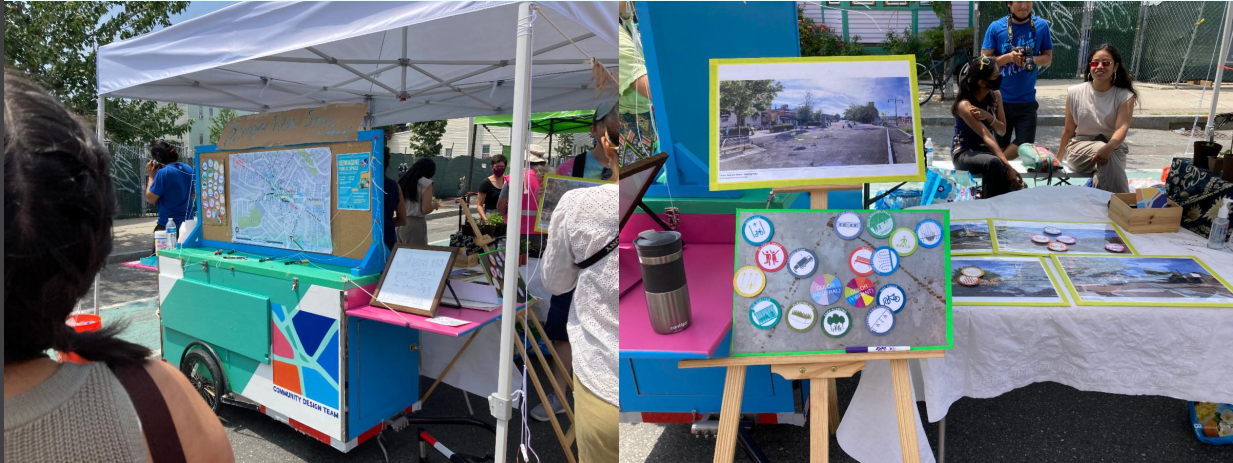
Image Description: Reimagine Union Square (Somerville) Pop-Up engagement effort, an inspiration for future Zoning Redesign engagement

The City of Newton's project to redesign the zoning code