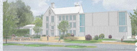
Cabot – Final Design Development

➤ MSBA SOI Submitted for Lincoln-Eliot / NECP