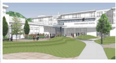
Zervas – Under Construction