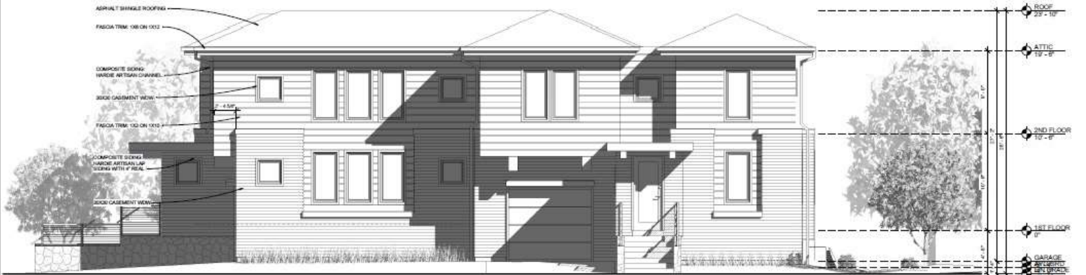
COLELLA ROAD ELEVATION