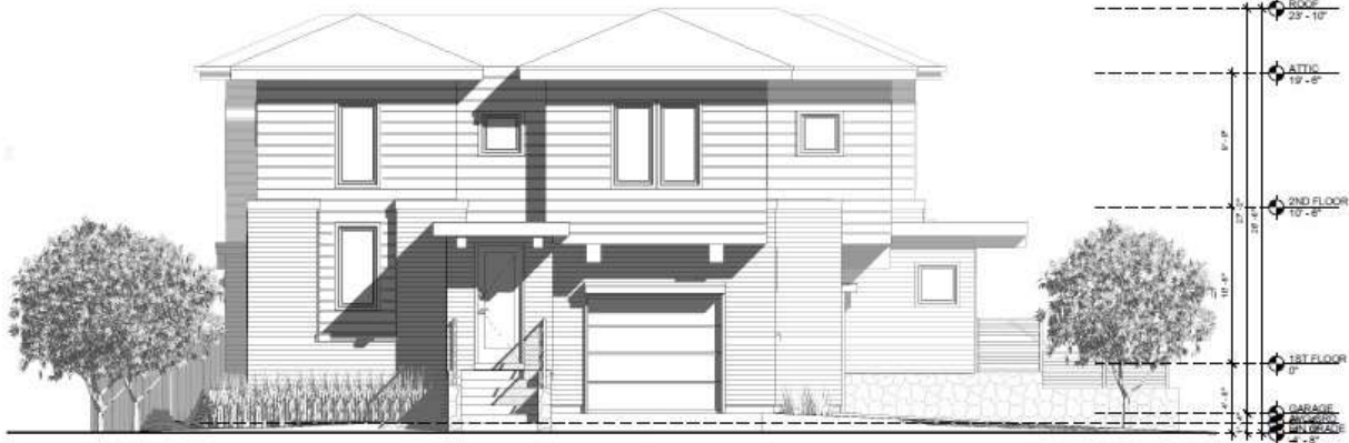
HANSON ROAD ELEVATION