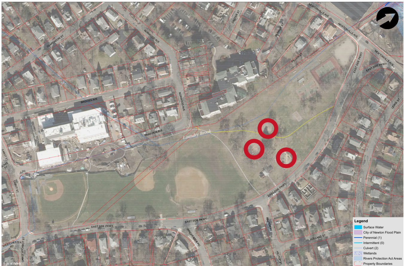
Cabot Park proposed locations