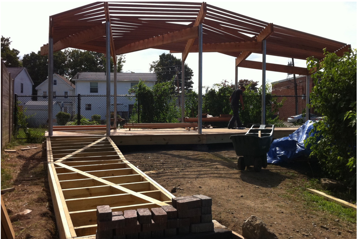
Construction in process

MASSART MASSACHUSETTS COLLEGE OF ART AND DESIGN