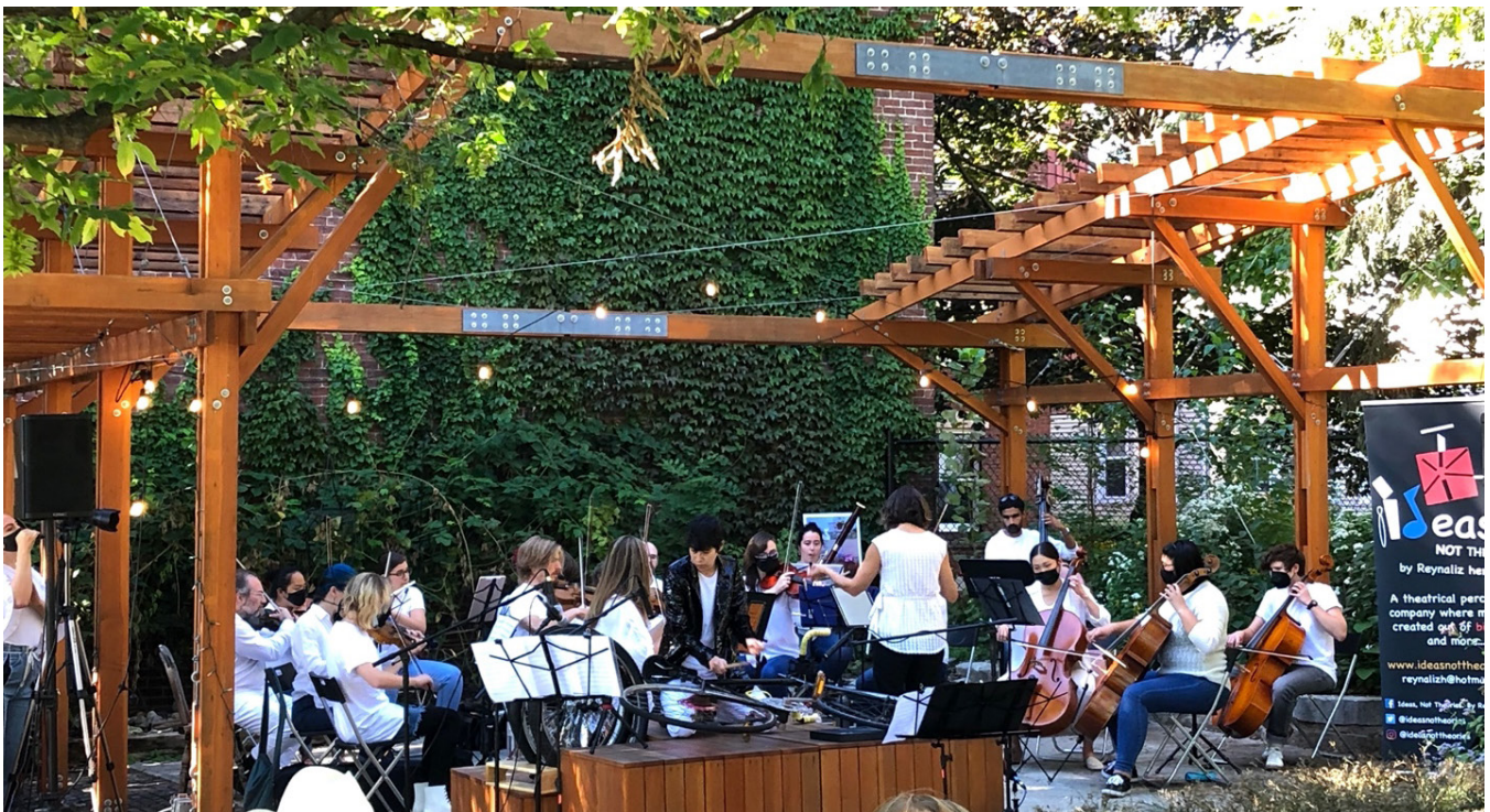
Somerville Growing Center: Gathering space