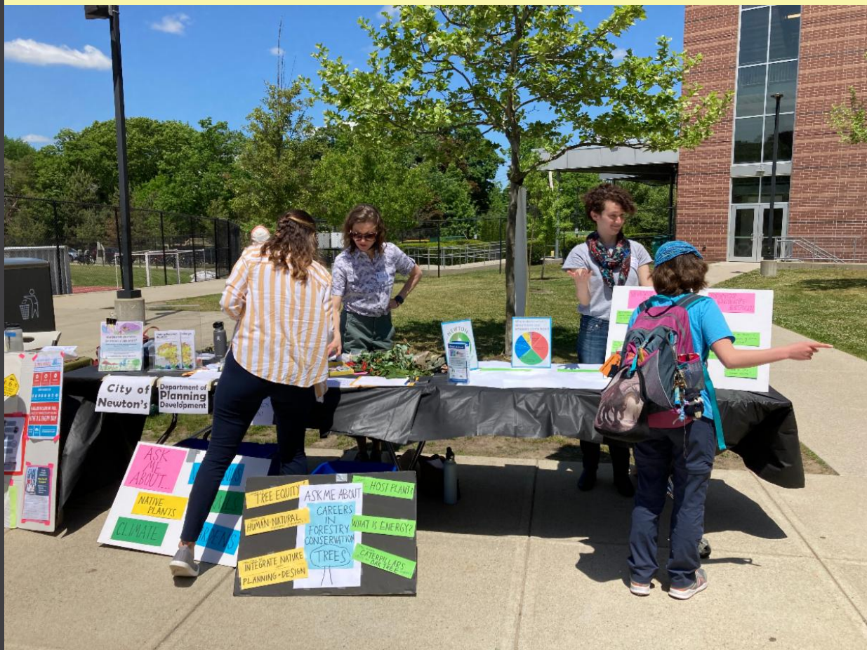
Image description: City of Newton planning staff speak with students and teachers while tabling outdoors at Newton North High School's Sustainability Day about Zoning Redesign, sustainability, housing, and transportation.