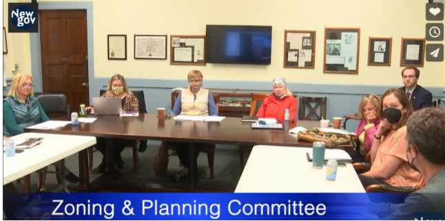
Zoning & Planning Committee

proposed policies in the draft zoning proposals for Village Centers.