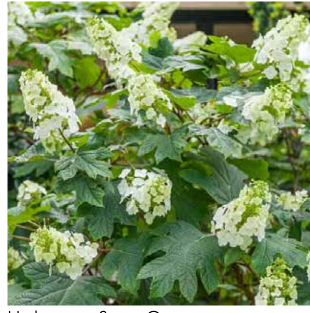
Hydrangea Snow Queen