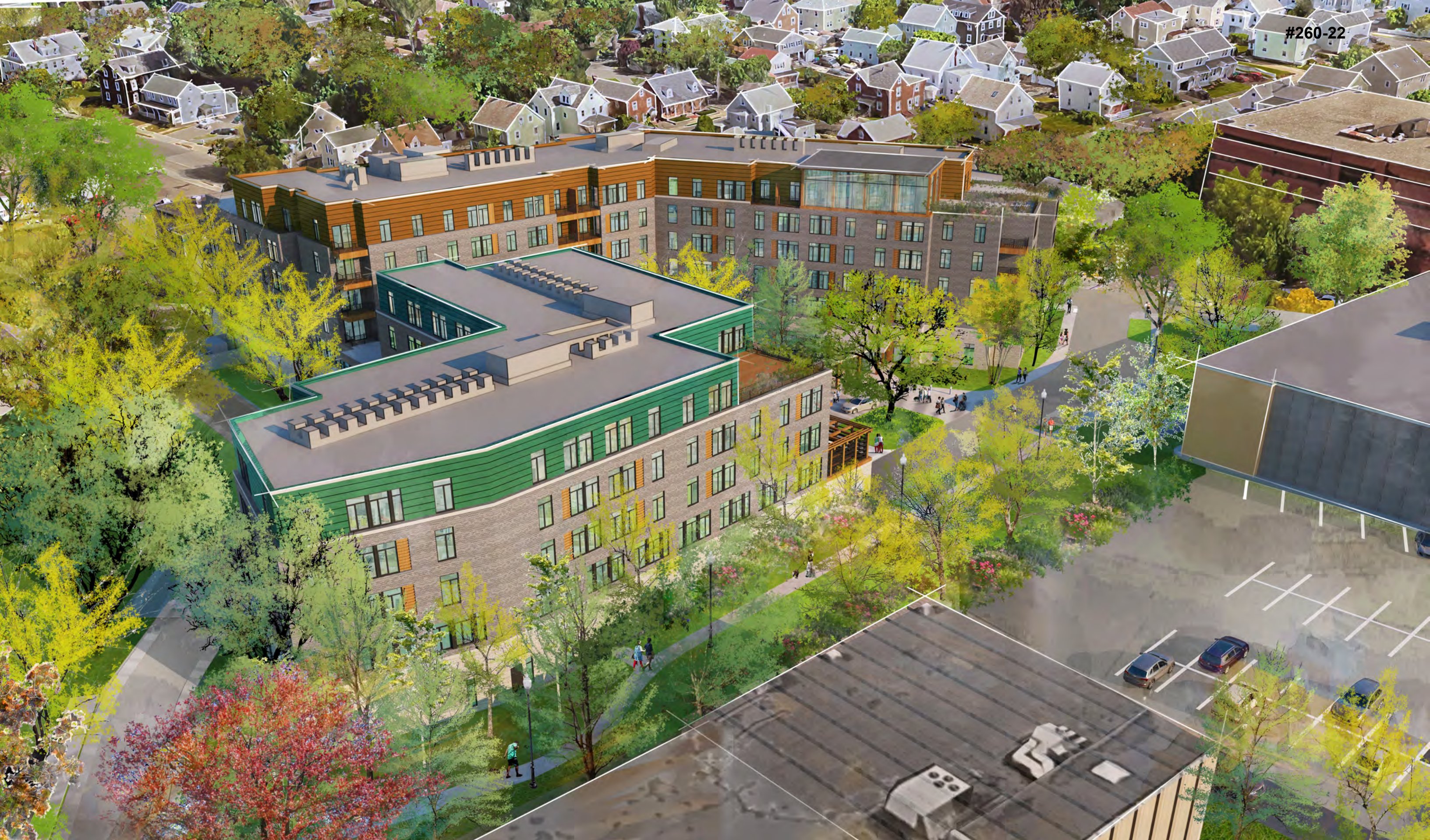
Aerial View Showing Pedestrian Connector