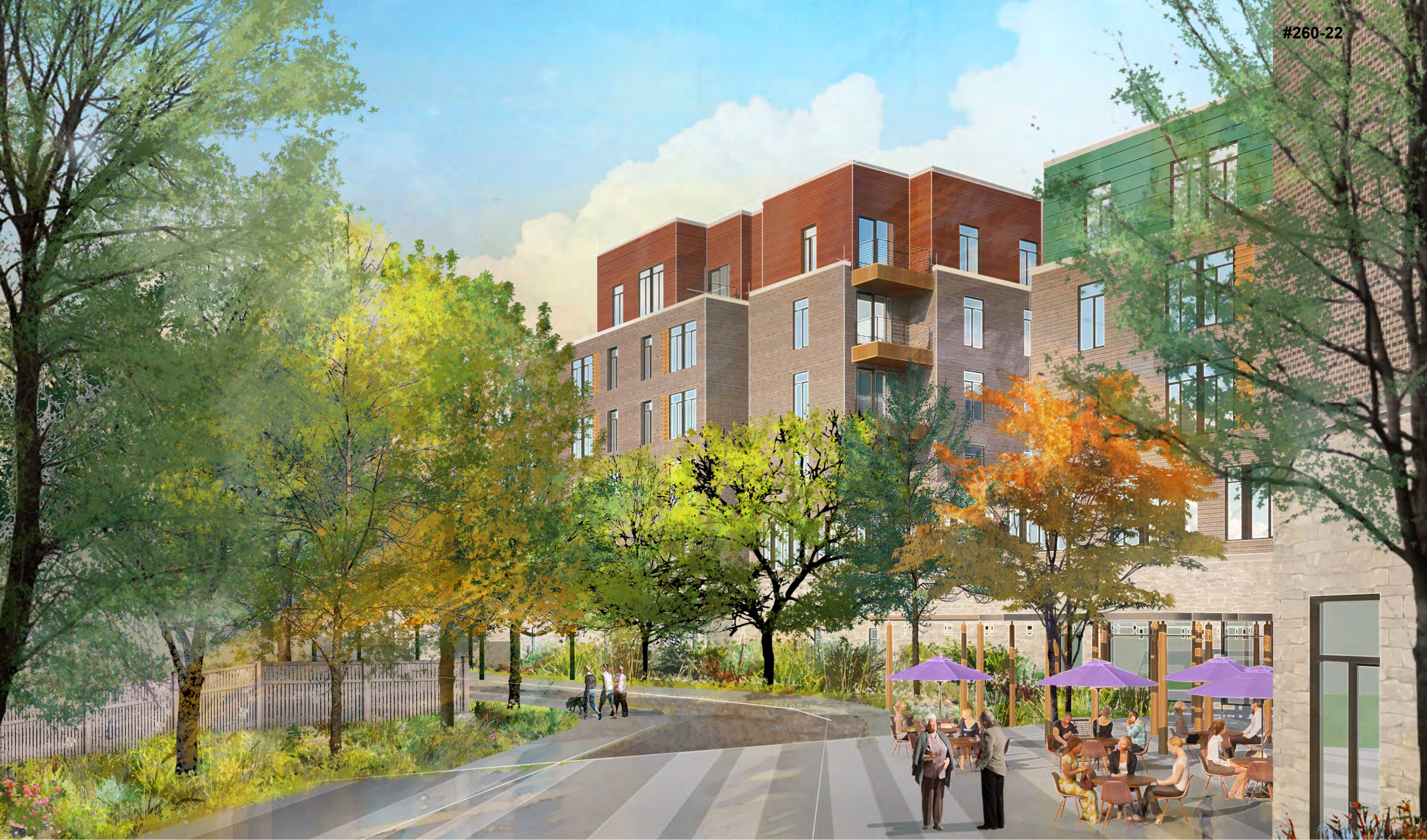
View of Service Path