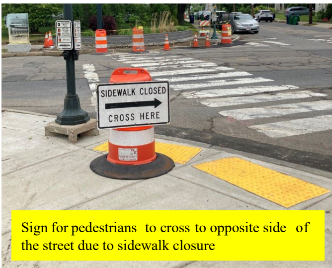
Sign for pedestrians to cross to opposite side of the street due to sidewalk closure