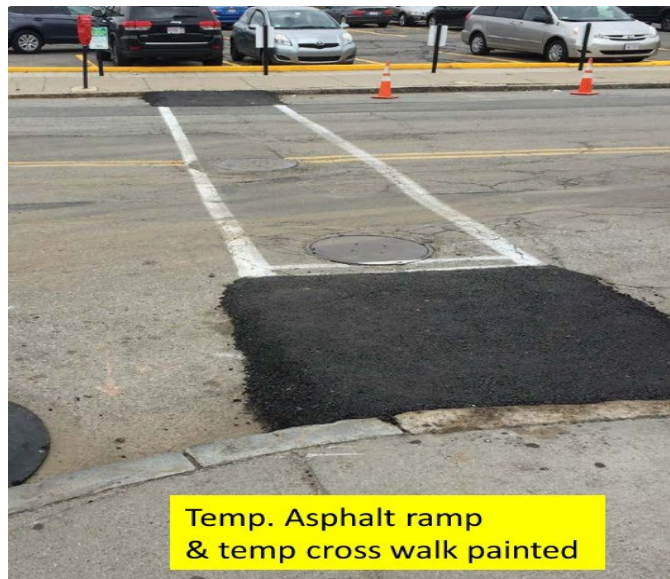
Temp. Asphalt ramp & temp cross walk painted