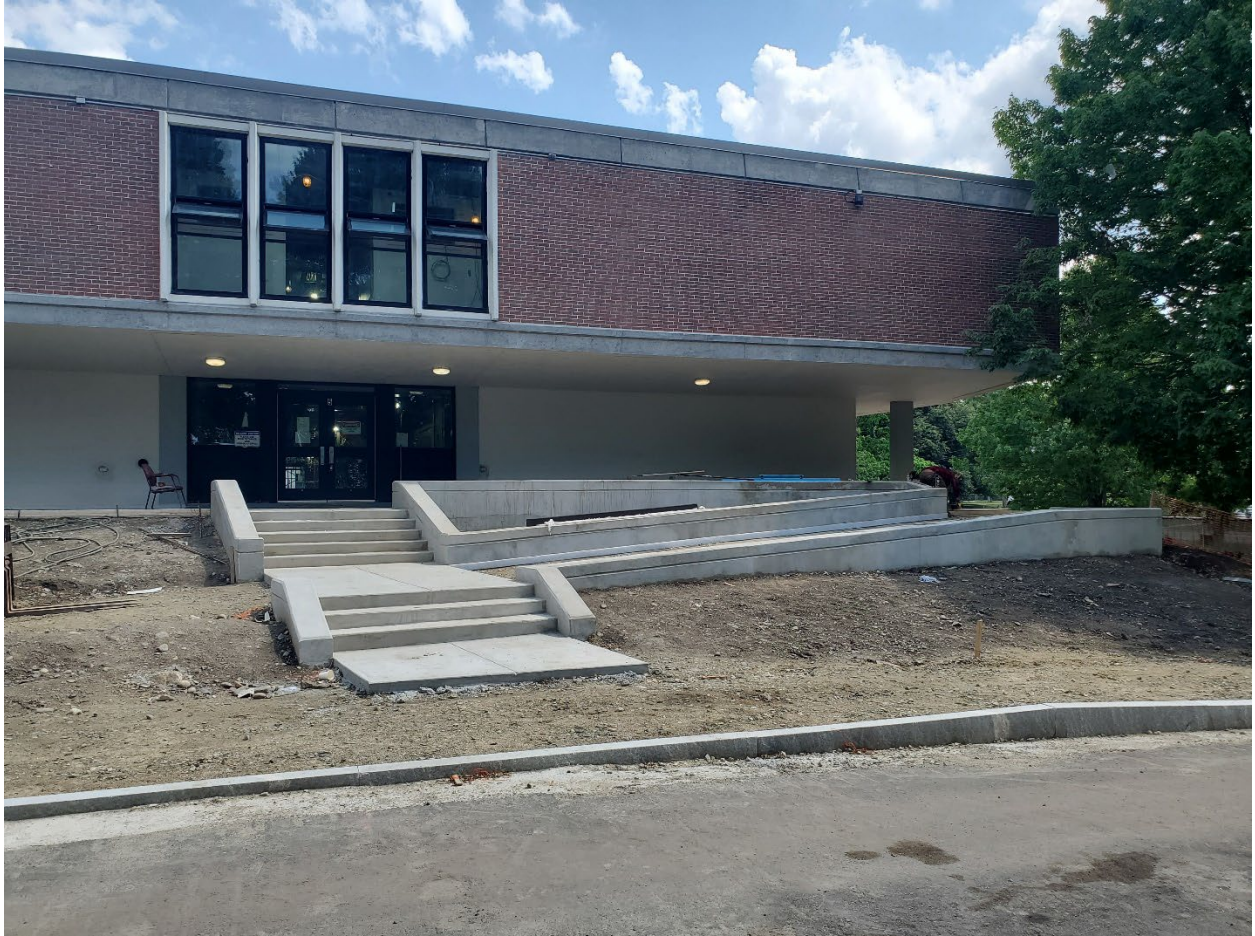
(Above) New stairs and ramps provide multiple accessible entrances and exits to the facility.