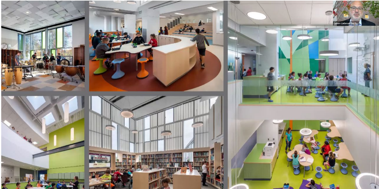
(Above) Some examples of previous projects completed by HMFH Architects.

The Franklin School Building Project has a total project budget of $55M, and is slated to be completed in the summer of 2029, but opportunities may present themselves to accelerate this schedule. We've assembled the Franklin School Building Committee, FRSSBC, and we've held several meetings to date. HMFH Architects are now onboard and have already begun the existing conditions analysis. The site survey will begin soon, as this will help with the prefeasibility site analysis. HMFH will continue to work with the entire project team to begin prefeasibility, school program and enrollment analysis, and the needs assessment phase of the project this summer and into the fall. To sign up to receive updates you can email us at franklin@newtonma.gov . To check out previous presentations and meeting recordings, you can click here . The next meeting of the Franklin School Building Committee and Community is on Thursday, August 11 th at 6:00pm, and you can register in advance by clicking here .