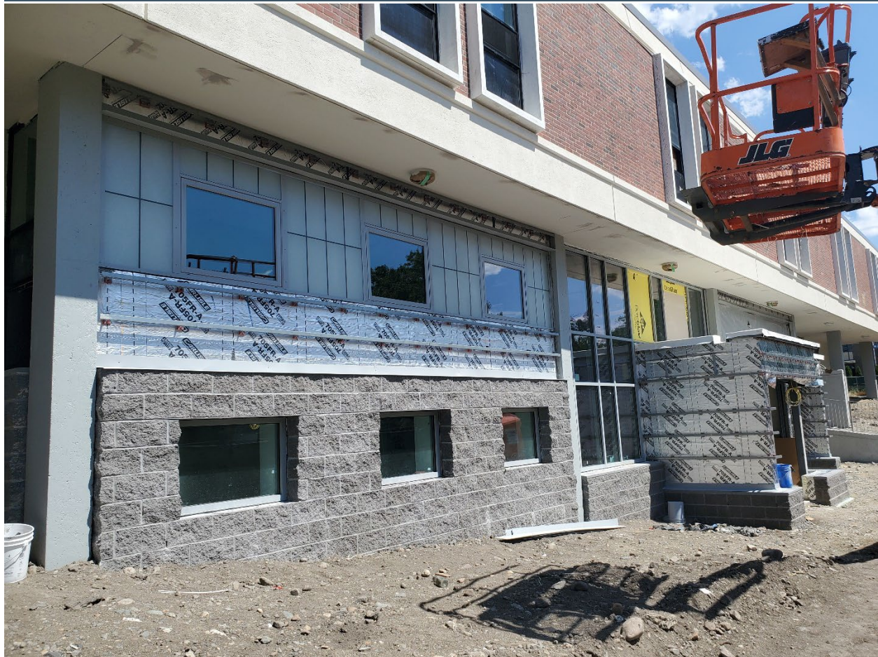
(Above) Breathing life into the renderings of the new main entrance.