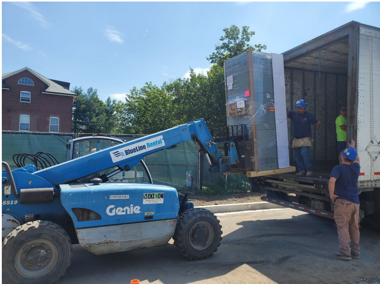
(Above) Our electrical switchgear just arrived. These will power the HVAC systems for the school, which allows us to operate with no fossil fuel consumption on site.

The Newton Early Childhood Program, NECP, project is going smooth. The total project budget is $13M, and our substantial completion date is in November of 2022, and we're on schedule and within budget. This week we will pour our last portion of concrete outside the building, and then we'll take a breather until the fall when landscaping and final paving will happen. Within the building we are in great shape. The plumbing and HVAC are in the home stretch. Our electrical switchgear arrived last week, and we anticipate having permanent power within the next two weeks. The new elevator is arriving shortly, and installation will start next week. Drywall is well underway, and painting is ongoing throughout the school. Flooring and final finishes are expected to start next month. To sign up to receive updates you can email us at necp@newtonma.gov .