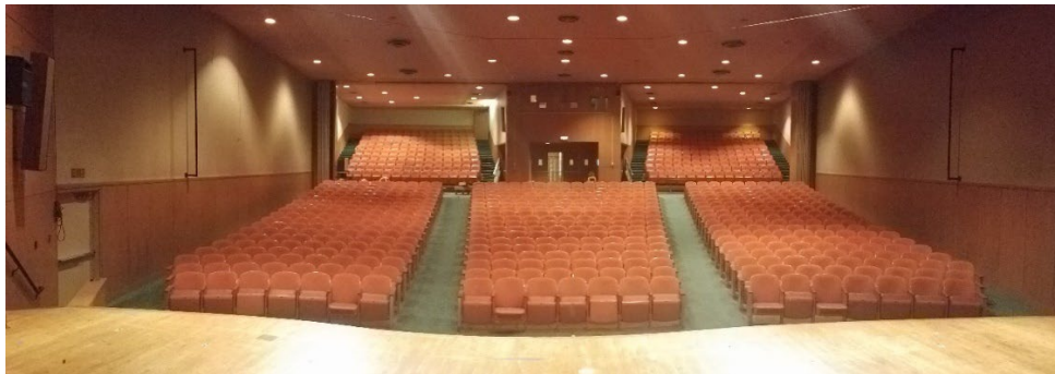
(Above) The existing auditorium has incredible potential!

The Lincoln-Eliot School Project has a total project budget of $50M, which includes $3M for the renovation of the auditorium. Construction is slated to begin in the summer of 2023, and the anticipated completion date is August of 2025. Last month, the City Council voted unanimously to approve the site plan and full project funding. Community outreach, communication, and collaboration will continue, but the latest plans seem to have broad support throughout the neighborhood. The neighbors have been engaged, and they've helped refine and advance the plans. The building floor plans are coming along great with MSBA space guidelines and programmatic adjacencies high on our list of priorities. Traffic and off-site parking are still very much a work in progress, and like all our projects this will be an area that we continue to work on for the next few years. We are now moving into the design development phase where we really start to focus on transitioning the conceptual design into detailed designs. This fall we will begin the final phase of design to meet the milestone of bidding this project in the spring of 2023. To sign up to receive updates you can email us at lincolneliot@newtonma.gov . To view previous presentations and meeting recordings, you can click here . The next meeting of the Lincoln-Eliot School Building Committee and community will be on Tuesday, September 13 th at 6:00pm, and you can register in advance by clicking here .