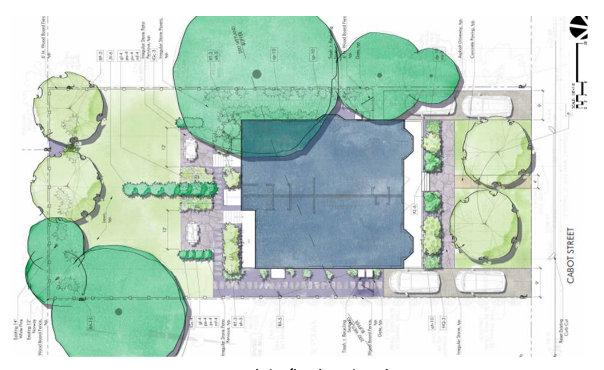
Proposed site/landscaping plan

Both additions would be constructed largely within the dwelling's existing footprint and there would be no changes to the dwelling's setbacks (that said, the conforming 9.2-foot left side setback would be extended approx. 16 feet toward the street). The proposed changes (which also include the creation of decks, stairs, etc.) would slightly increase the lot coverage from 26% to 28.2%. Regarding the open space on the parcel, the Planning Department requests that the petitioner confirm the open space calculation in advance of or at the upcoming public hearing.