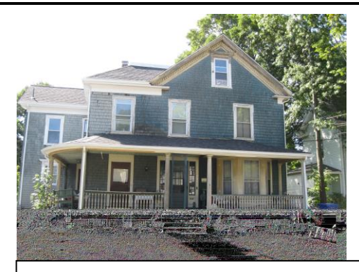
336 Cabot Street

The purpose of this memorandum is to provide the City Council and the public with technical information and planning analysis conducted by the Planning Department. The Planning Department's intention is to provide a balanced review of the proposed project based on information it has at the time of the public hearing. Additional information about the project may be presented at or after the public hearing for consideration at a subsequent working session by the Land Use Committee of the City Council.