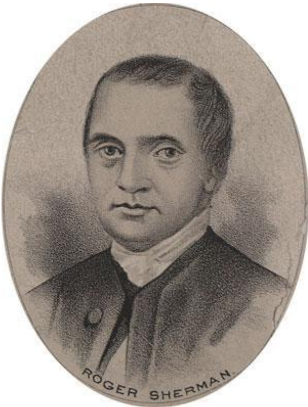
by Ole Erikson, Engraver, c1876