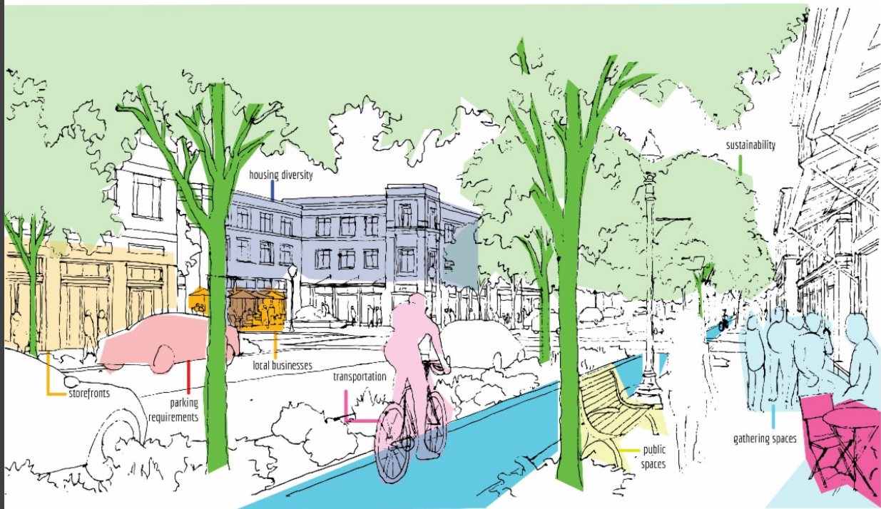
Image description: A sketch of a vibrant street with sections highlighted that represent what zoning rules impact. This includes storefronts, parking requirements, local businesses, transportation, housing diversity, public spaces, gathering spots, and sustainability.