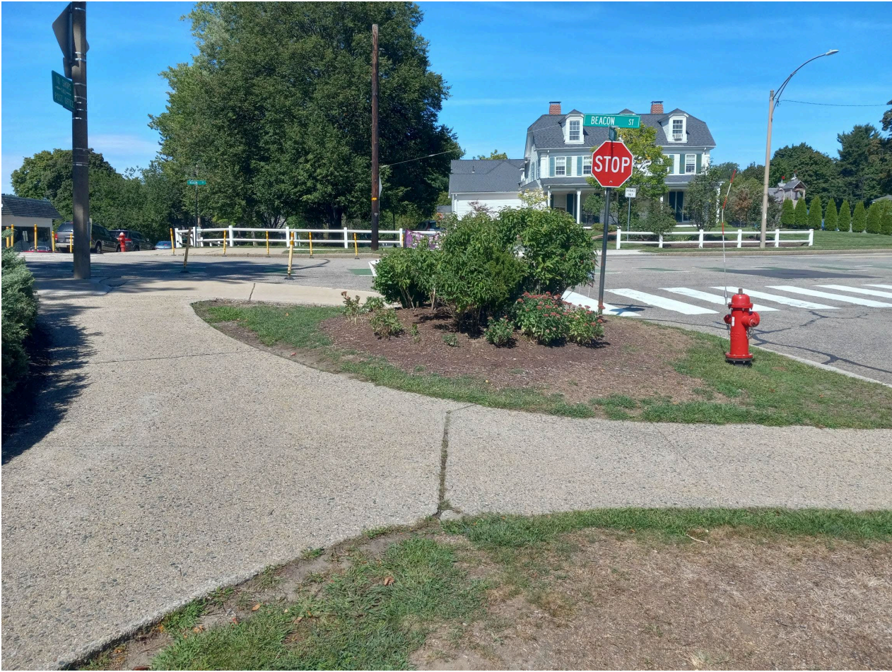
Existing Conditions Photograph of Proposed sign location at Beacon Street and Collins Road.(below)