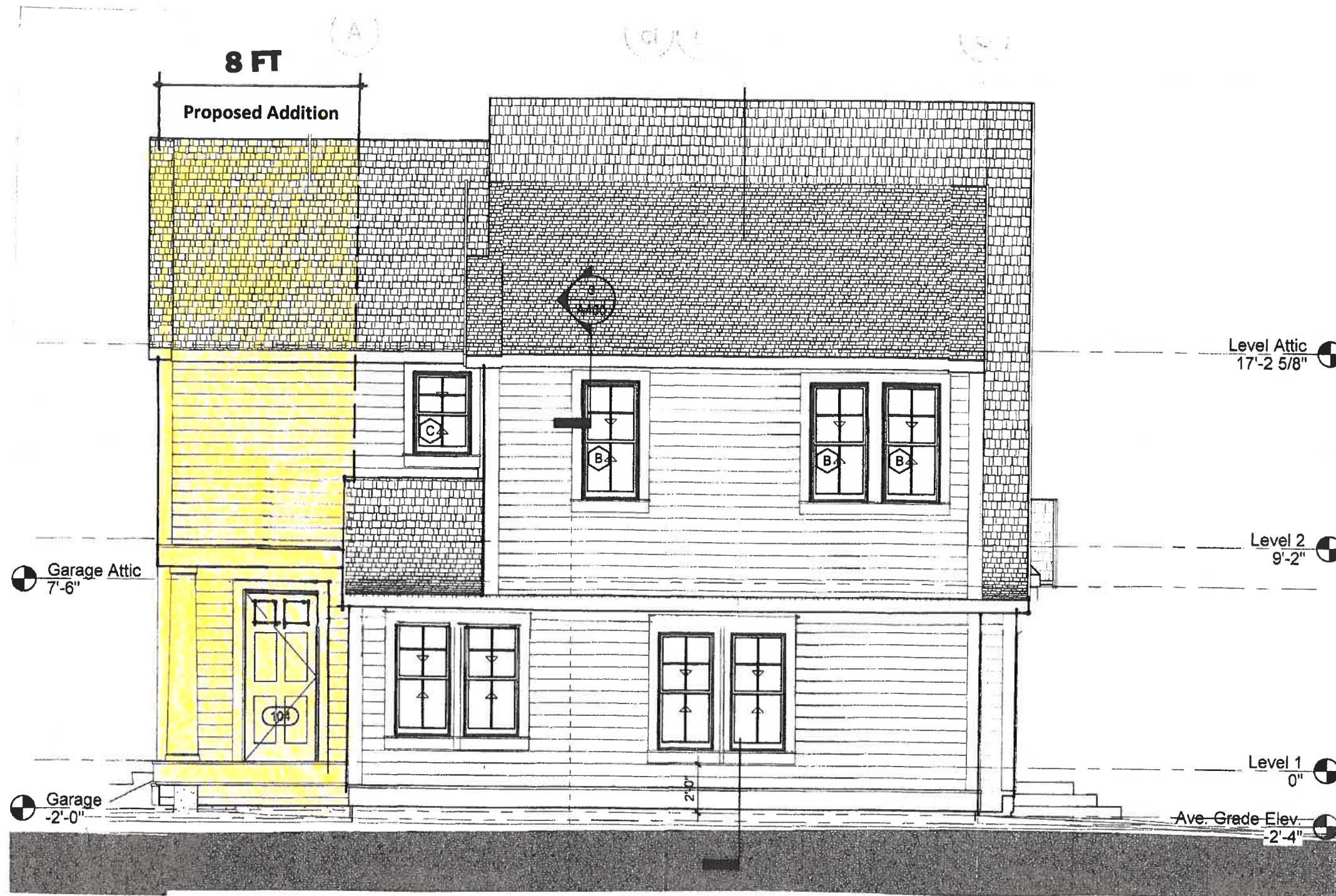
SIDE/ FERNWOOD ELEVATION