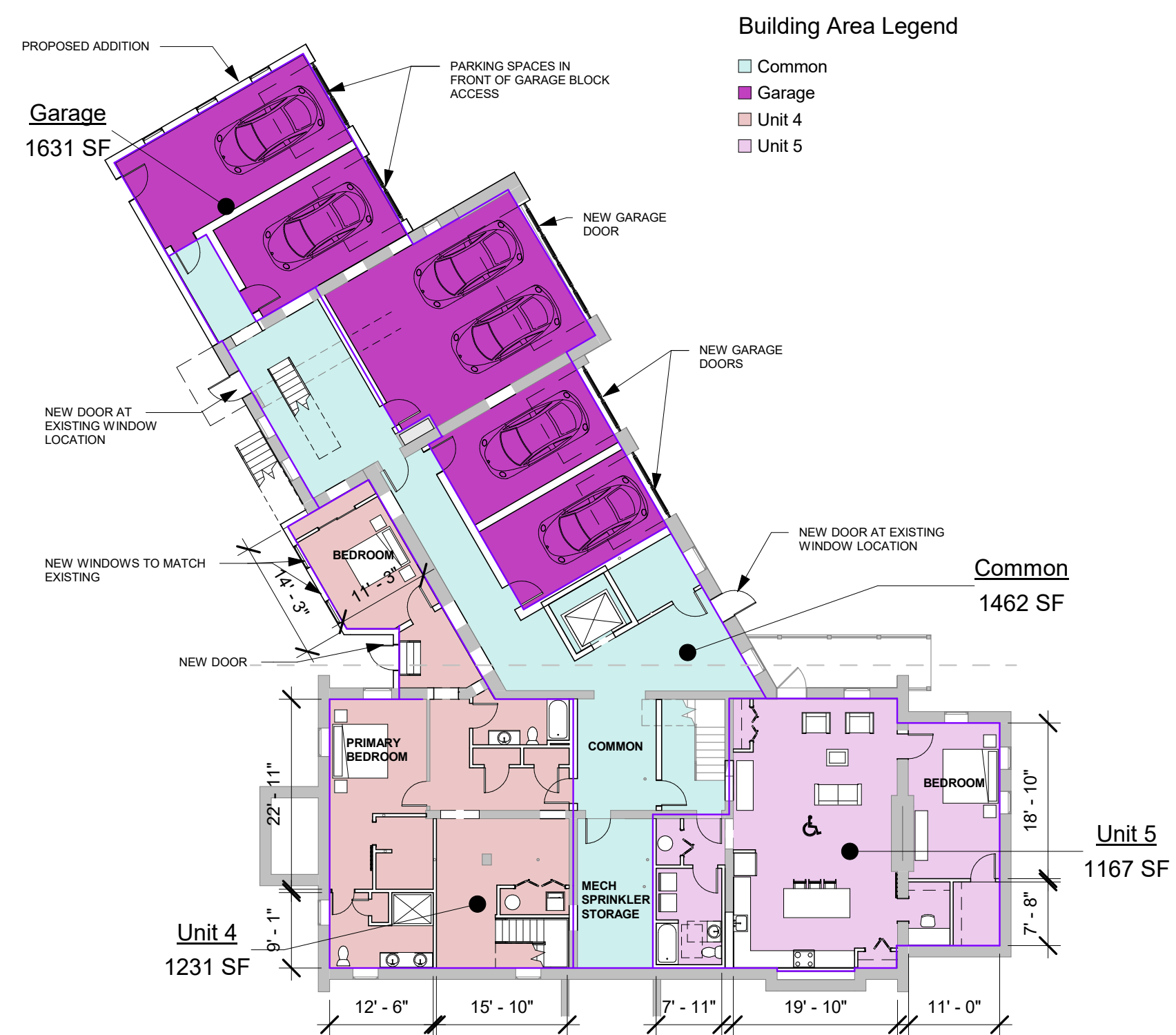
① Ground Floor Plan 1/16" = 1'-0"