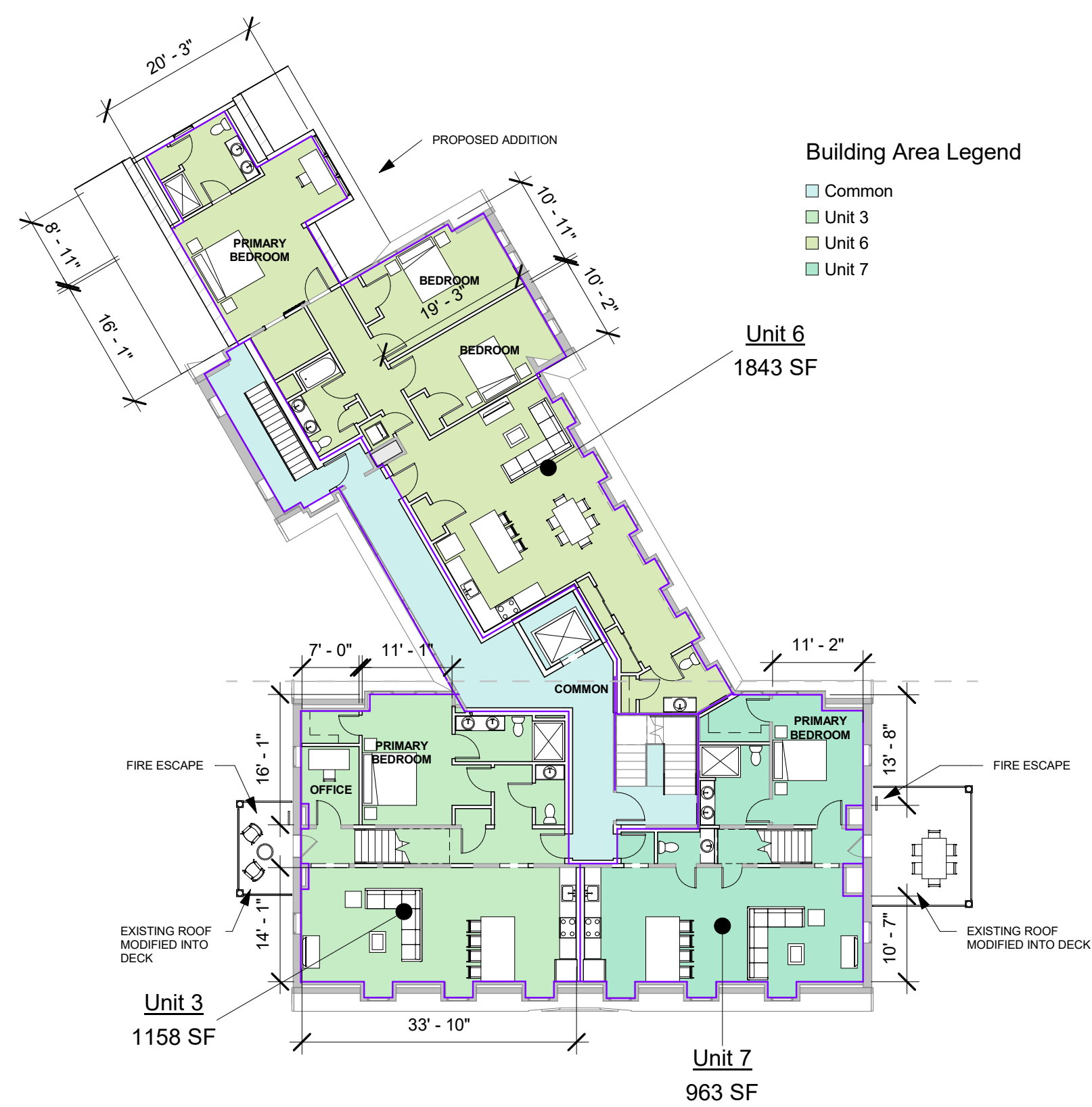
③ Second Floor Plan 1/16" = 1'-0"