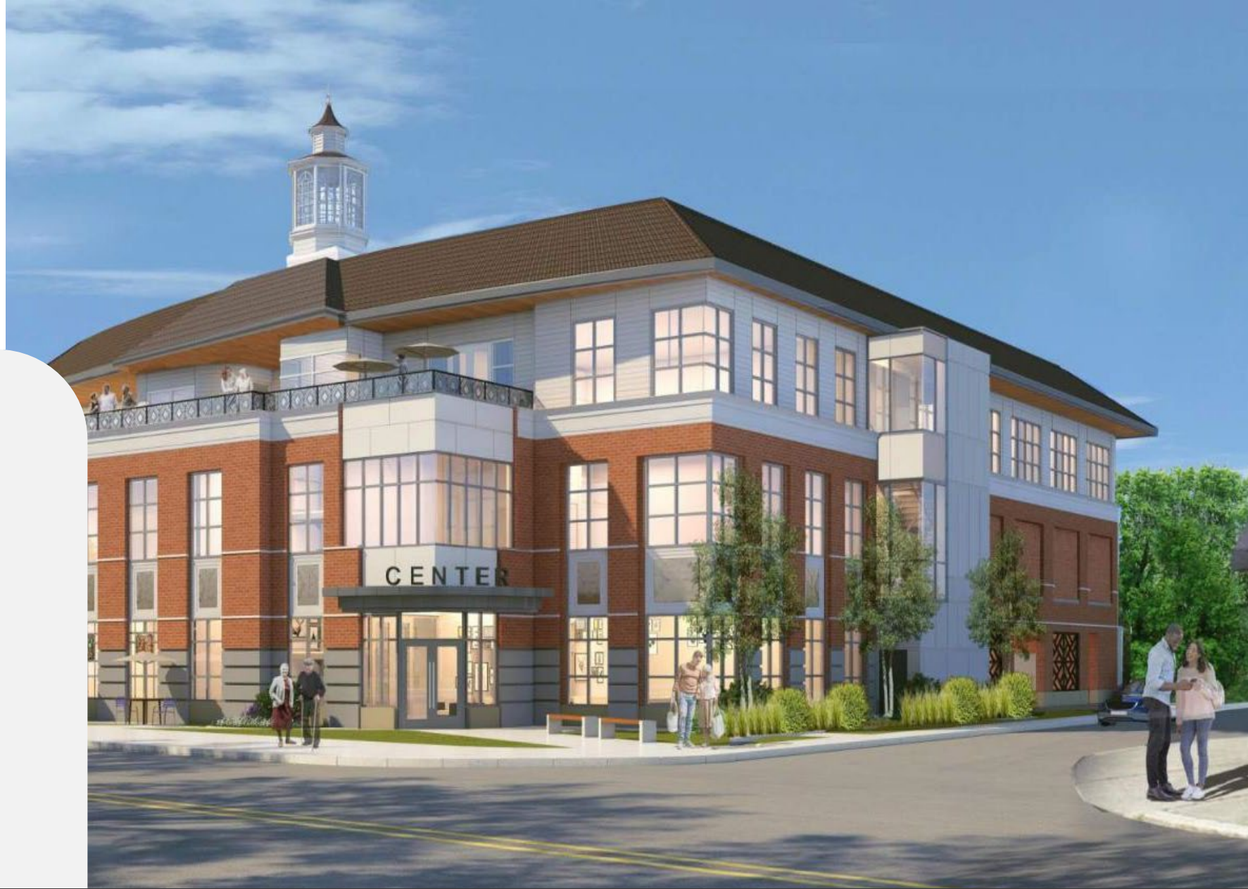
New Senior Center Facility (NewCAL)