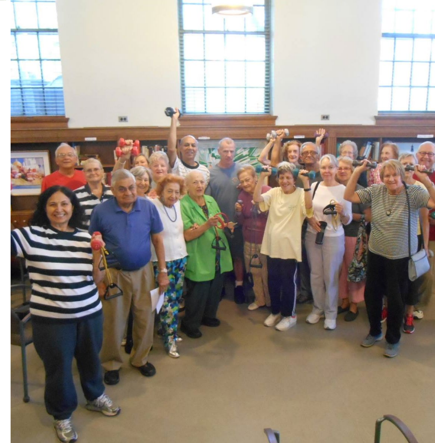
Balance and Mobility