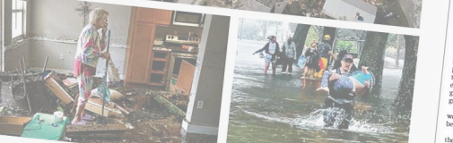
An aerial view on Thursday showed some of the destruction in Fort Myers, Fla., which bore marks of Hurricane Ian's brunt. A woman took stock of her apartment in that city (above left), while stranded people were rescued in Orange County (above right).