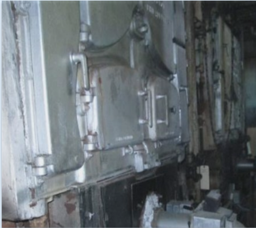
71-year-old oil-fired boilers at the Peirce School