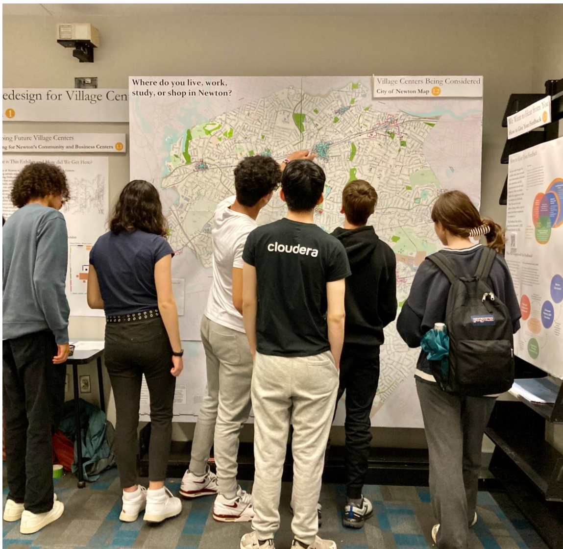
Image description: Newton North High School students look at the large map of Newton in the village center zoning exhibit at Newton Free Library. City staff guided about 100 high school students through the library exhibit in the last week of engagement, consisting of the Youth Commission and four NNHS classes.