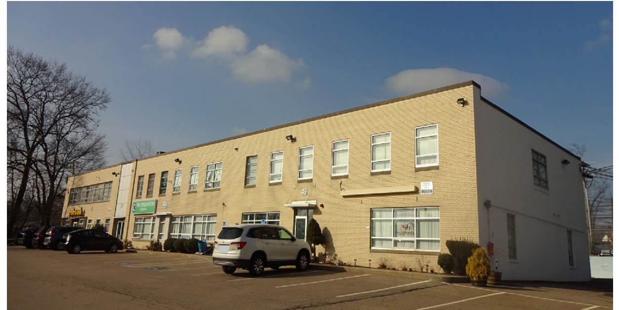
49-51 Winchester Street