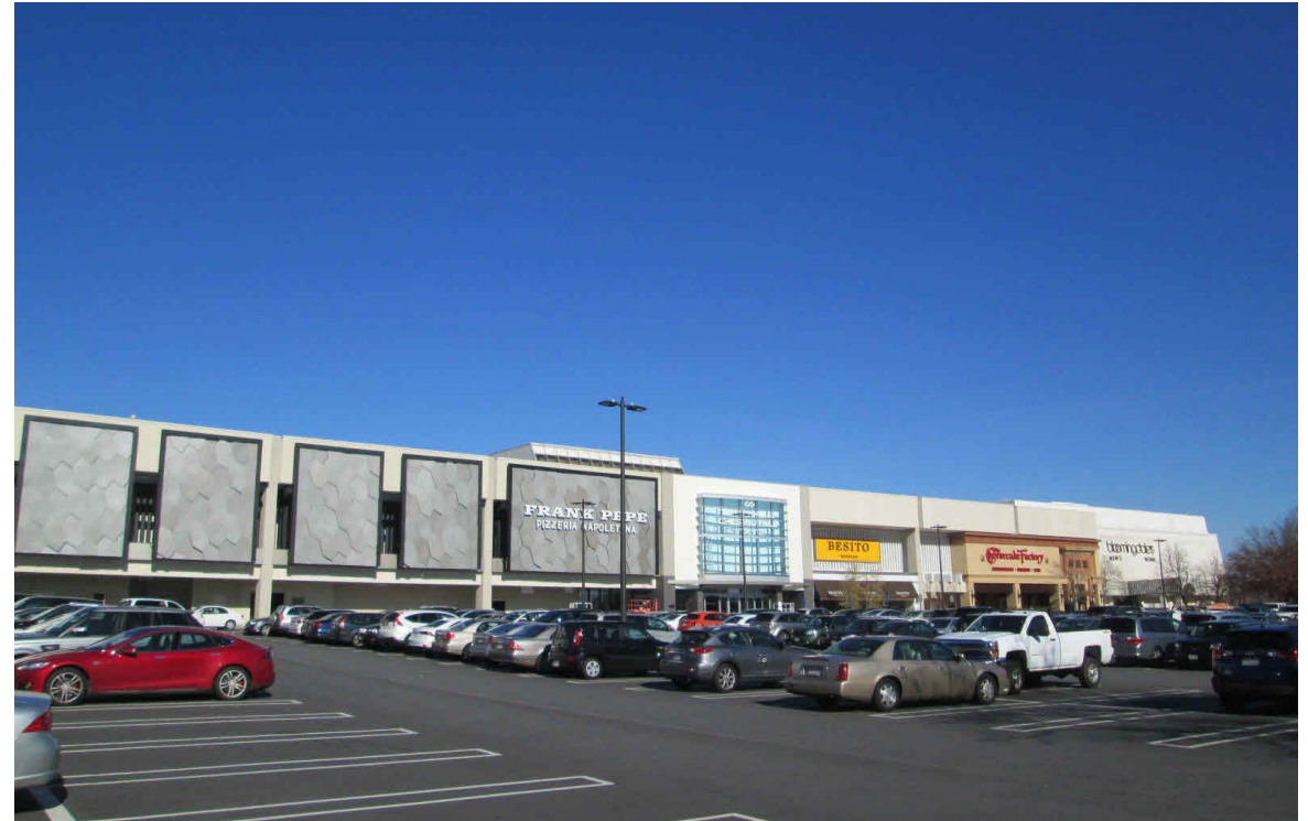
199 Boylston Street