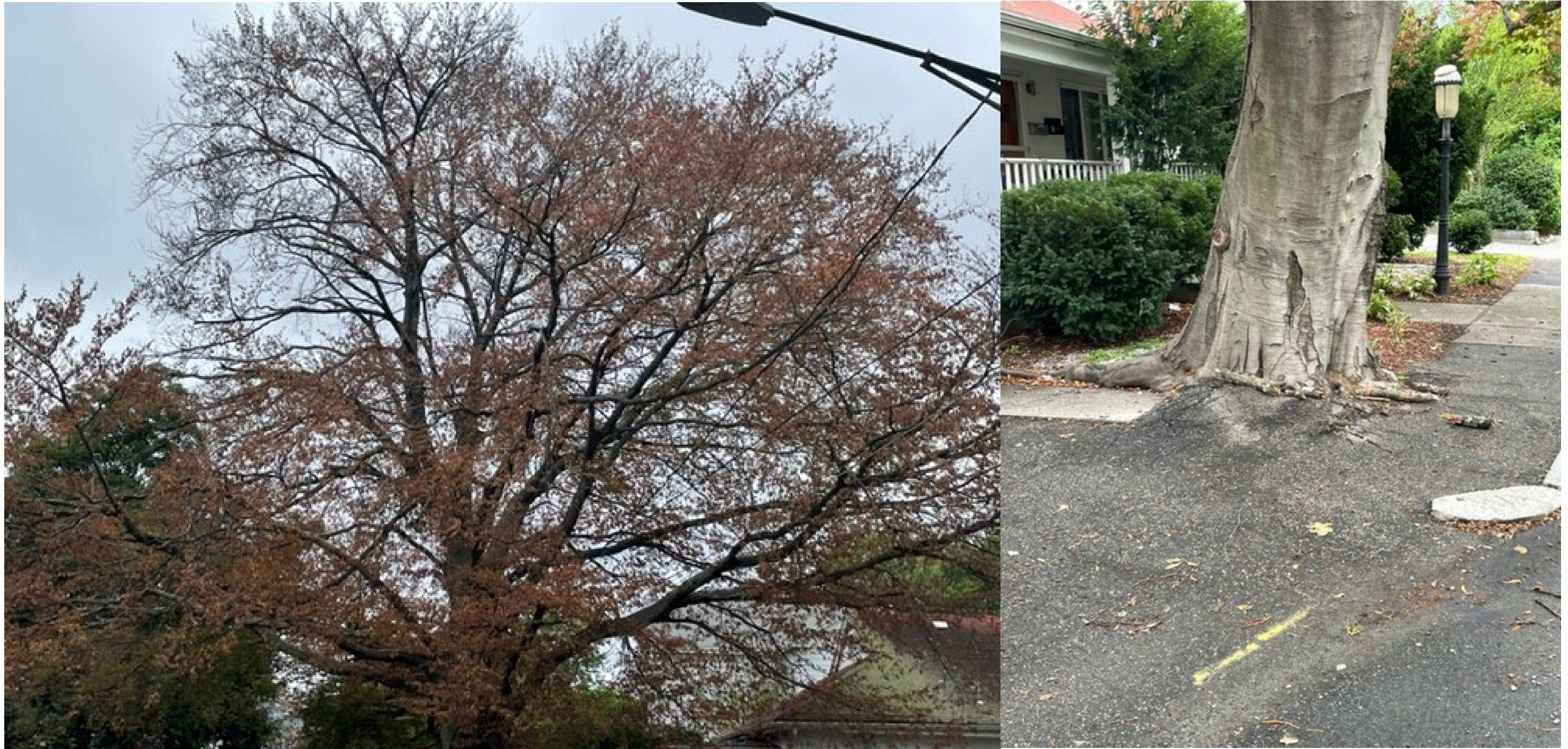
Image of assessed beech tree taken on September 27, 2022.