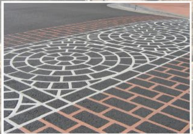
Example of stamped asphalt at intersection

WIDEN SIDEWALK WITH PAVERS AND TREE BUFFER