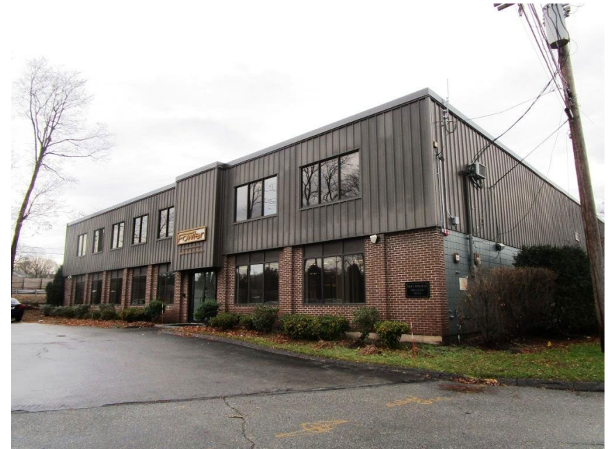
45 Crescent Street