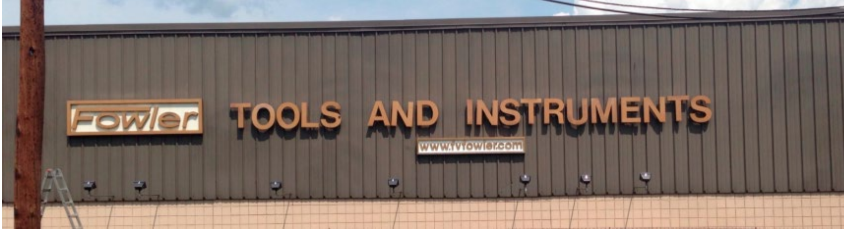
Existing Sign 191 sf