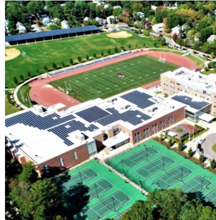
NNHS TIGER STADIUM LIGHTS (2023)