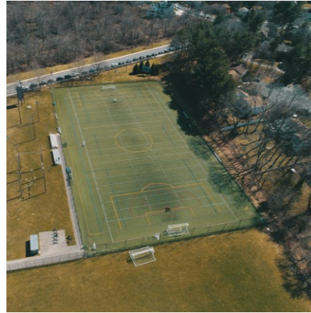
NSHS BRANDEIS RD FIELD (2023)