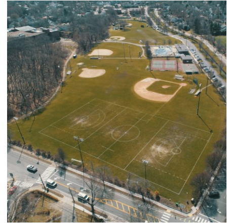
ALBEMARLE CRAFTS ST FIELD (2023-2024)