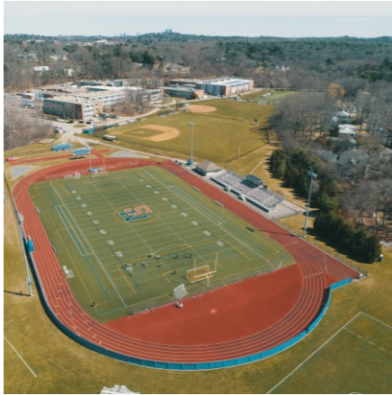
NSHS WINKLER STADIUM (2023)