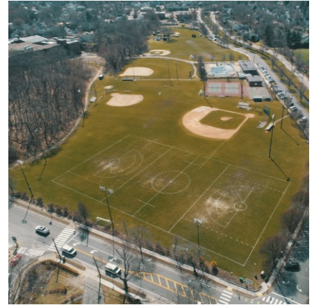
ALBEMARLE LIGHTS (2023-2024)