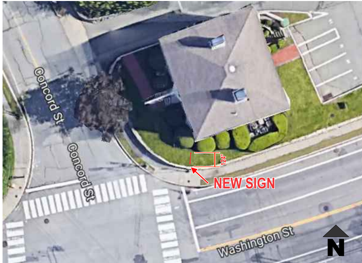
AERIAL SITE PLAN