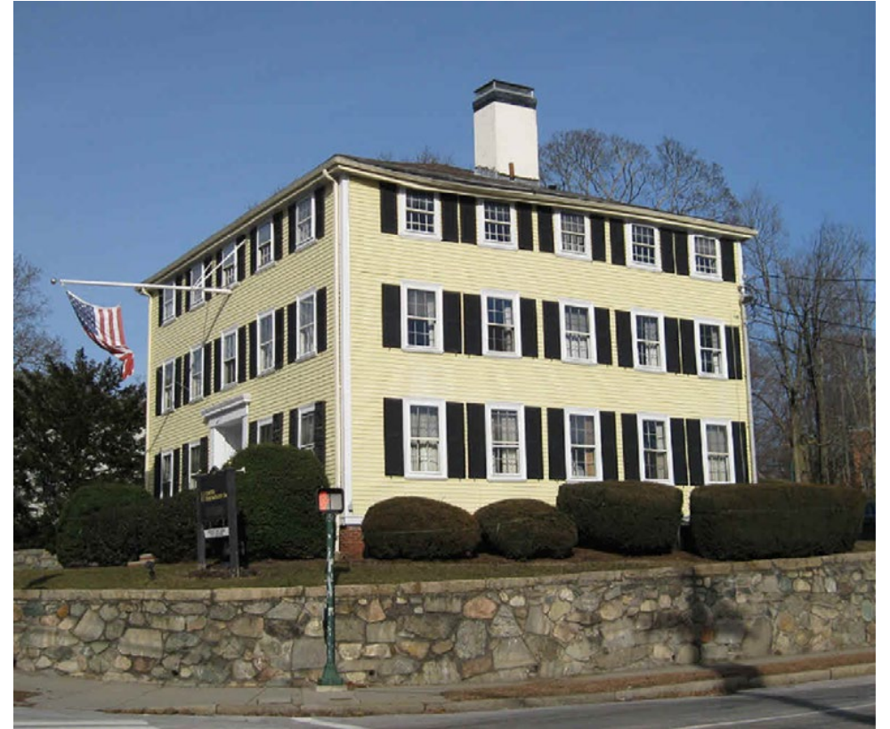
2345 Washington Street