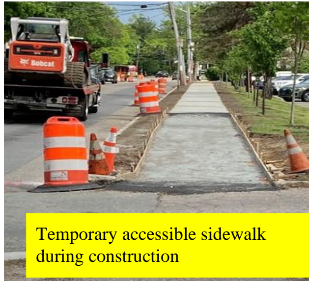
Temporary accessible sidewalk during construction