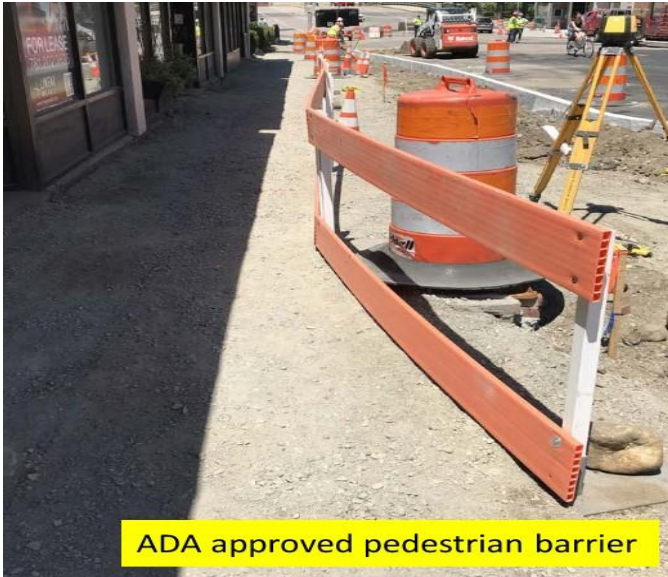
ADA approved pedestrian barrier