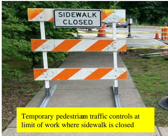
Temporary pedestrian traffic controls at limit of work where sidewalk is closed