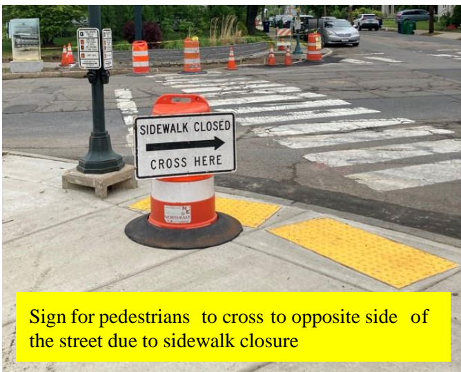
Sign for pedestrians to cross to opposite side of the street due to sidewalk closure