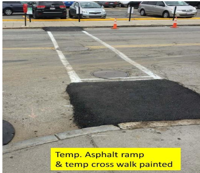
Temp. Asphalt ramp & temp cross walk painted