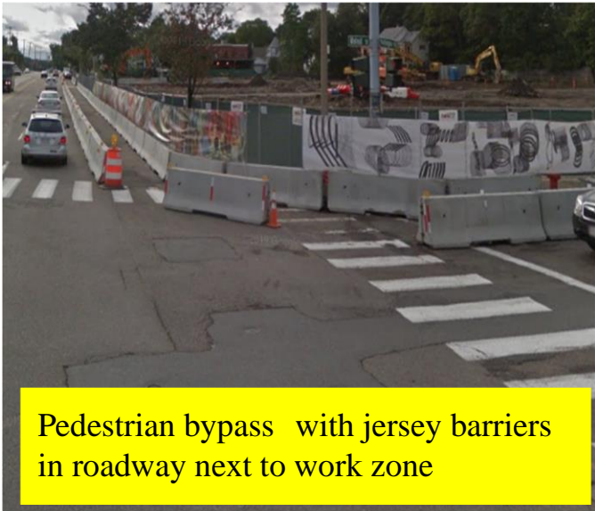
Pedestrian bypass with jersey barriers in roadway next to work zone