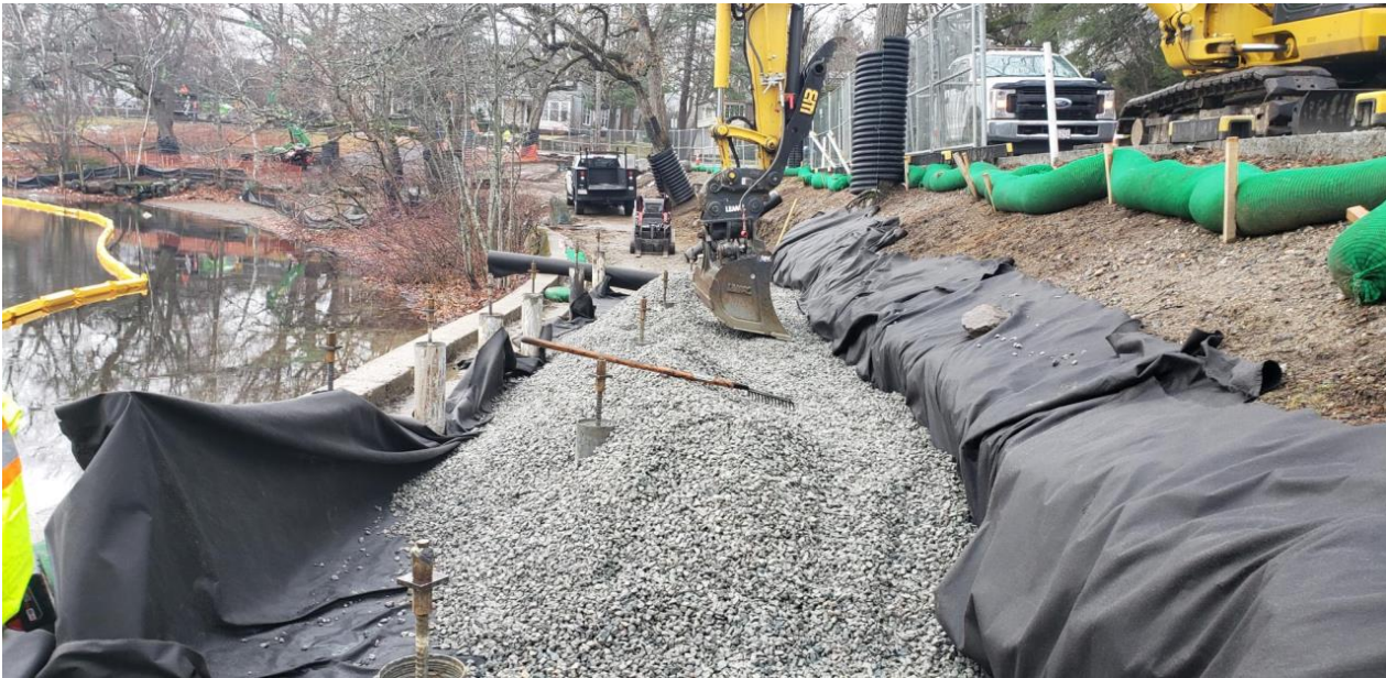
Weeks of January 9th, 2022 through January 16th, 2023: Continued site preparation; Tree pruning; Park boulder inventory