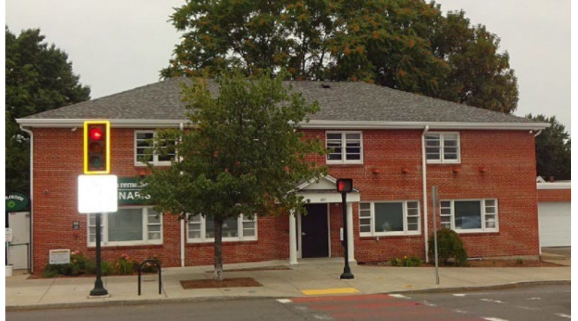
697 Washington Street