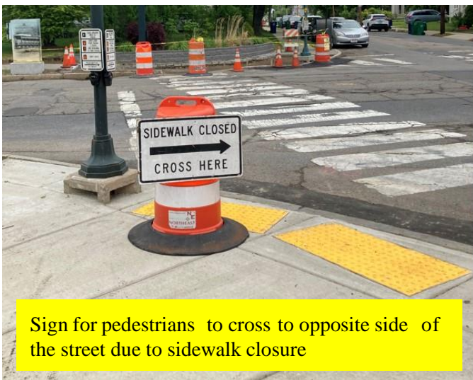
Sign for pedestrians to cross to opposite side of the street due to sidewalk closure